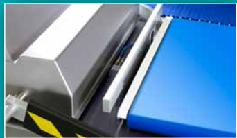
FULL AUTOMATIC SYSTEM