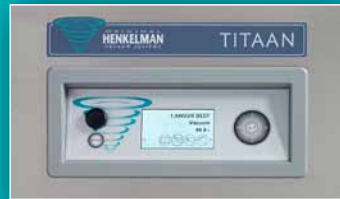
ADVANCED CONTROL SYSTEM